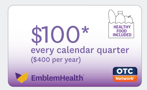
*Each $100 credit can only be used during the quarter it was given with no carryover allowed.

For more information on the OTC benefit, visit emblemhealth.com/essentialplanotc .