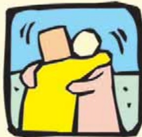
Hugging or Kissing