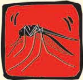
Mosquitoes or Other Bugs